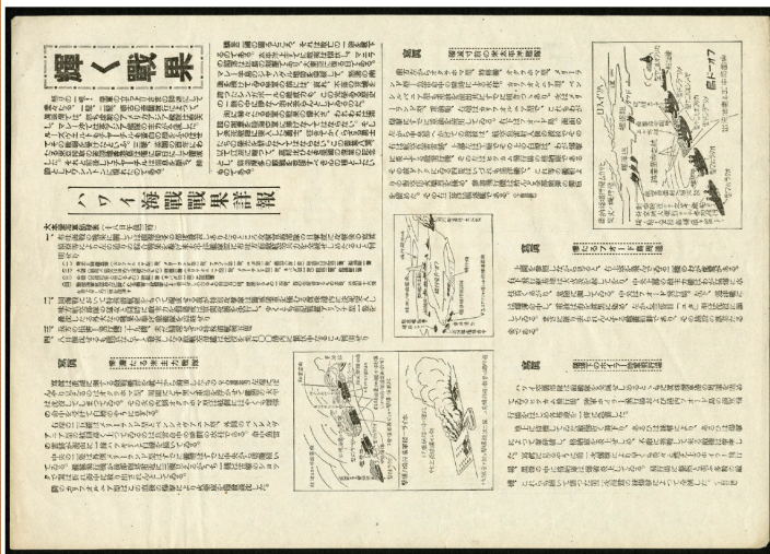
Unknown, Japanese announcement on the attack at Pearl Harbor, Japan, 1941. (The Glider Lehman Institute of American History, GLC0952.01 p.1)